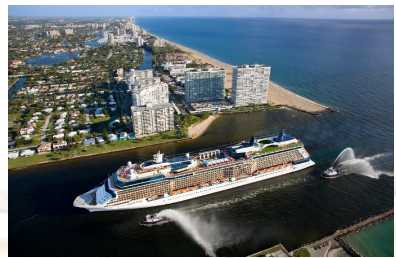
Travel and Tourism